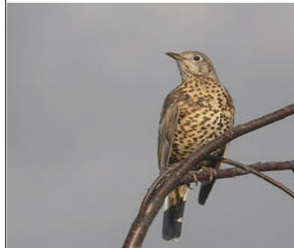
A mistle thrush