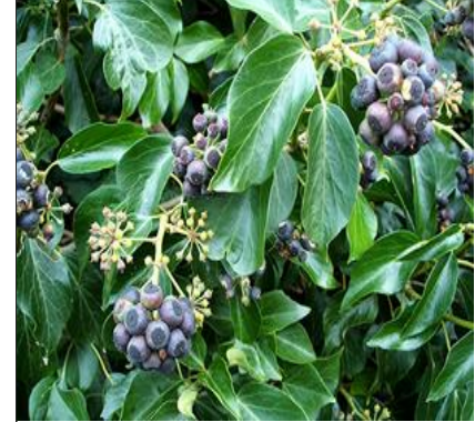
Ivy fruits (black)