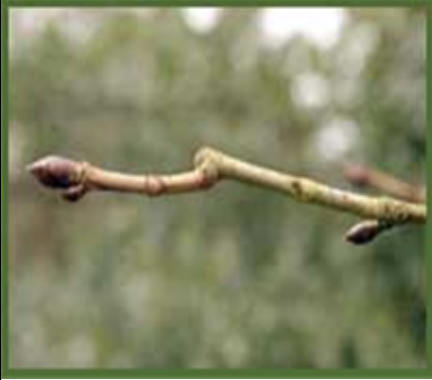
A large sticky bud