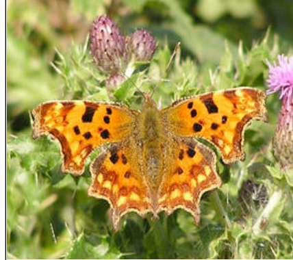
A comma butterfly