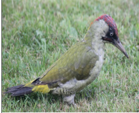
A green woodpecker